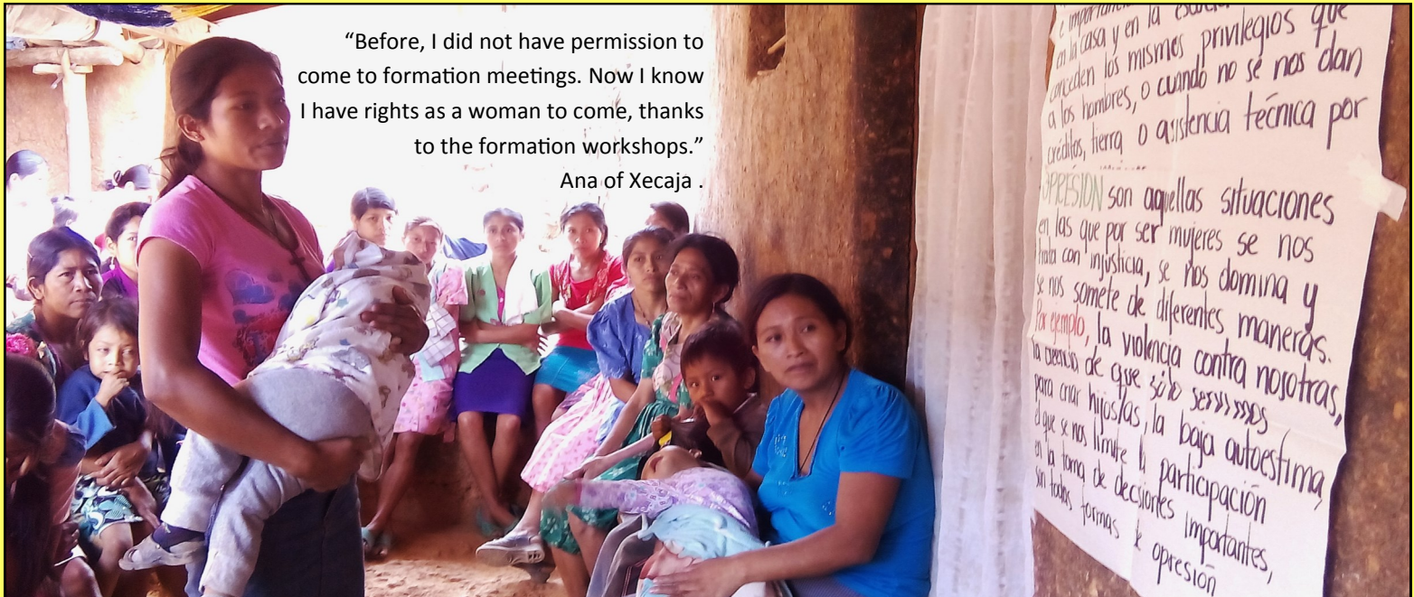
Workshop on discrimination, Pitahaya, March 2016. Providing opportunities for women to reflect on their reality and develop new skills is critical for their own self development.

Project Harvest works with women who live in poverty or extreme poverty, are marginalized, experience discrimination, and are malnourished. They confront on a daily basis the need to care for and feed their families. Project Harvest's program not only focusses on improving food security but also addresses the exclusion and inequality that women face.