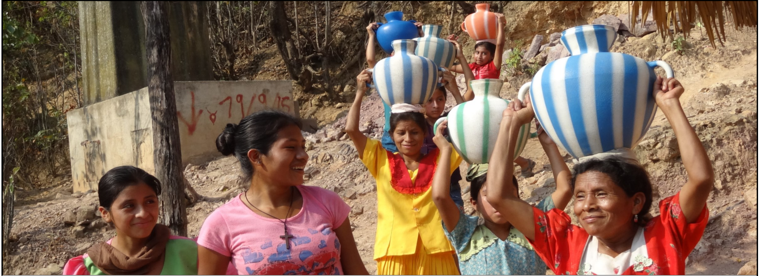
Communities want to transform their reality. Here, they carry water to test a prototype cistern.

Even in normal times, with a good rainy season, when plantations provide temporary work and when they succeed in selling hand-crafted products, families are poorly fed throughout the year. However, when there are droughts or excessive rainfall, when diseases such as coffee blight impact the availability of work,