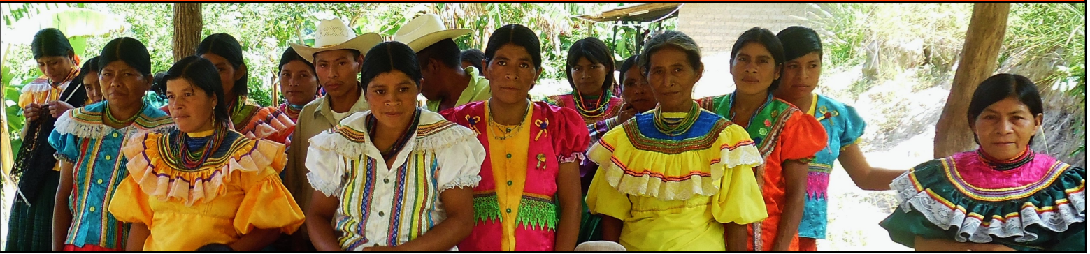
Women of La Ceiba - The contrast between their colorful dress and their acute poverty shocks the eye.

This year, 2016, Project Harvest widened its program into two new communities, La Ceiba and La Libertad (22 and 33 new families respectively in each community). Families on average have 8 children. Both communities share some characteristics such as the same level of extreme poverty. The topography of the communities is steep (up to 60% slope). The soils are extremely rocky and shallow, and have little natural fertility. Both communities are out of the reach of economic and social support programs from State institutions and other development agencies. This poverty and marginalization were the main criteria for the decision by Project Harvest to work in this area.